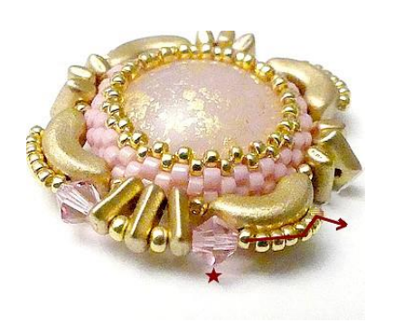
11) Insert 1 B4 into the SB15. Repeat steps 9 to 11 throughout the round. Exit through the sixth SB15