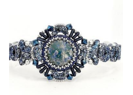
20) Another color 😊