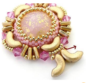
13) Here is the result Exit through the SB11 HERE