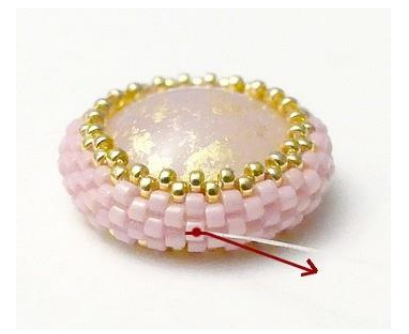
5) Make 2 rounds with the SB15. Exit the thread HERE in the third round of DB11