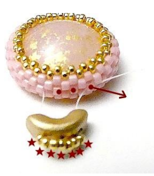
6) Insert 1 Arcos, 7 SB15 pass in the Arcos and exit through the third DB11 of the same round