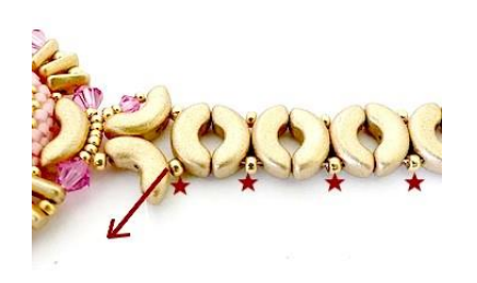
17) Insert 1 SB11 between the two Arcos and exit through the Arcos HERE