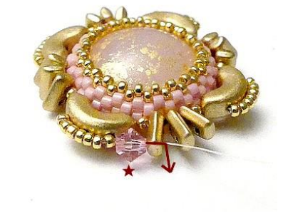
9) Insert 1 B4 into the second hole of the Piros