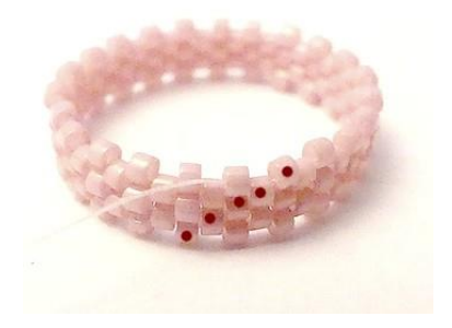
2) Make 5 rounds of DB11 3) Make 2 rounds with in peyote