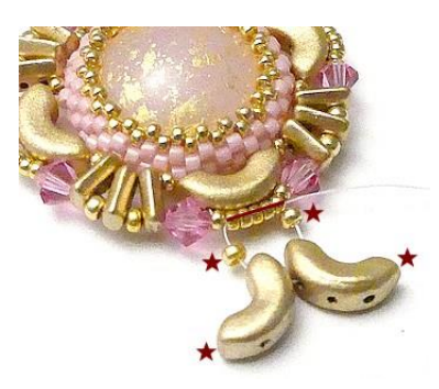
12) Insert 1 SB11, 2 Arcos and 1 SB11 into the same 5 central SB15. Strengthen the work!