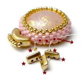
7) Insert 1 SB15, 3 Piros, 1 SB15 in the third DB11