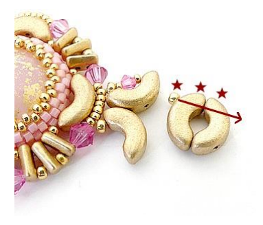
15) Insert 1 SB11 and 2 Arcos. Repeat the step five times