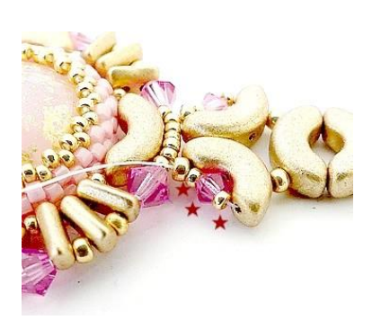
18) Insert 1 SB15, 1 B3 and 1 SB15 through the SB11.

Reinforce the work by passing through all the beads (steps 15 to 18). Repeat the steps to the other side of the bracelet.