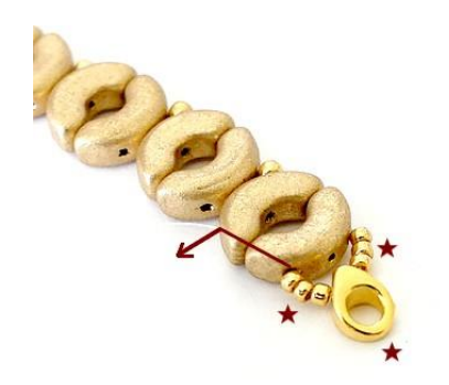
16) Insert 3 SB15, 1 Cymbal (or SB8) and 3 SB15 into the two Arcos