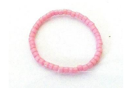
1) Insert 46 DB11 and close