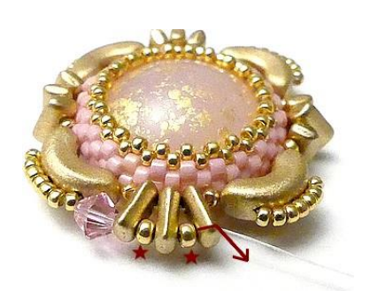
10) Insert twice 1 SB11 between the two Piros