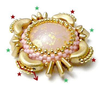
8) Repeat steps 6 and 7 alternately.