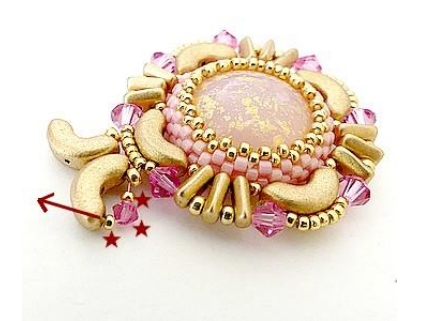
14) Insert 1 SB15, 1 B3, 1 SB15 through the Arcos