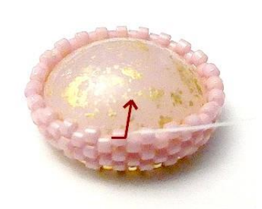
4) Turn over your work. Exit the thread HERE and insert your cabochon